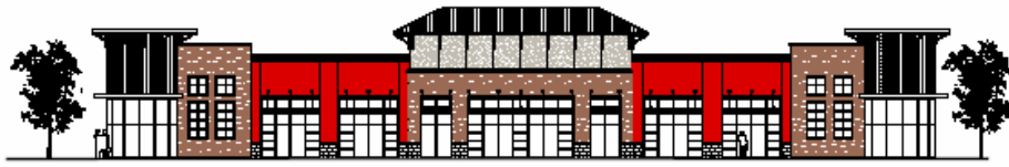
LOT 5 NORTH ELEVATION